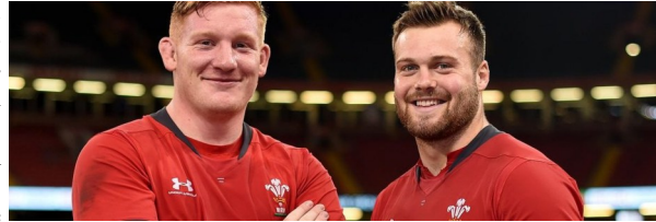
Rhys Carre and Owen Lane, playing for the Welsh Rugby Team at the 2019 Rugby World Cup. Two ex-pupils of Cowbridge Comprehensive School.

The Physical Education department also run hugely successful, but all encompassing extracurricular activities. All you have to do it look at the department's 'Twitter' page, and you will see all of the activities in which they have been involved, consisting of hundreds of pupils and an exceptionally broad spectrum of activities. Although, the school has won a countless number of Welsh, Regional and County competitions, and produced a large number of international athletes